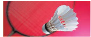
Appropriate speed of Gosen brand shuttlecock

Not only smashes which exceed 350 kilometers per hour but also hairpin shots requiring fine control of not more than several centimeters, the characteristics of badminton play results from the use of shuttlecocks. Gosen select the best raw feathers from the highest quality geese, raised for more than 6 months after incubation in their original habitat in China. Sixteen high quality cut stem feathers are formed by an ultra precision flocking machine. Then, high quality cork is fitted to complete shuttlecocks of the highest quality and durability.